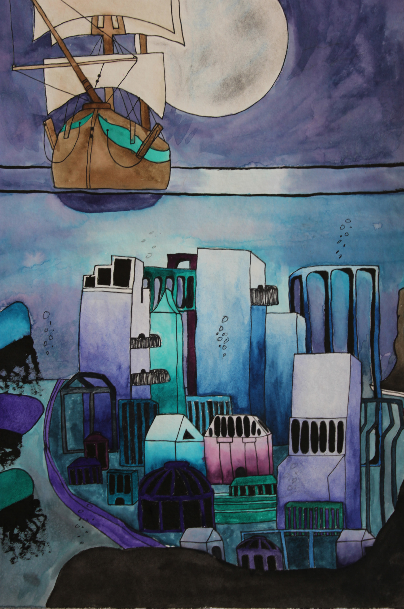
"Bluewaters" By Maxine Lebo