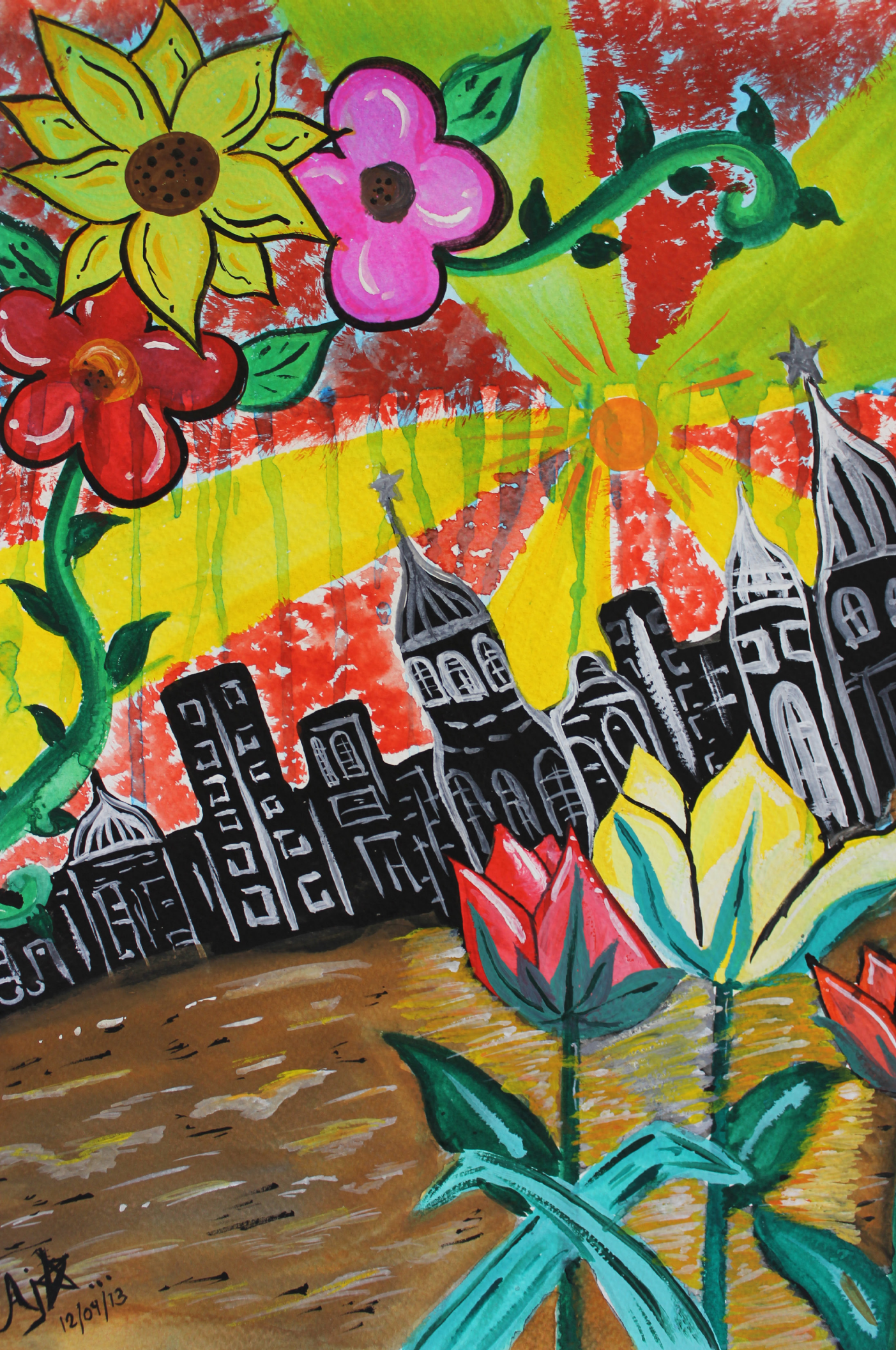
"Sunset in Holland" By Arrah Alcobilla